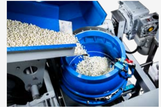
TE 60 A 2-batch system with separation unit

Fast and gentle processing of large quantities of workpieces