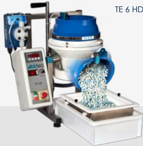
TE 6 HD

Workpieces and grinding material are put into an open-topped working bowl with a disc-shaped bottom which puts the whole mixture into a toroid-shaped flow. The centrifugal force accelerates workpieces together with the abrasives to the stationary streamlined inner wall of the working bowl. An effective grinding is achieved by a relative movement of workpieces and abrasives caused by their different specific densities. This dynamic flow facilitates a high, selective grinding with very short cycle times compared to vibratory or drum finishing systems.