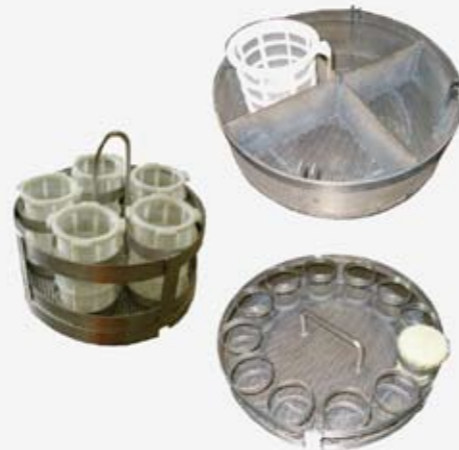
Bulk materials as well as sensitive parts can be dried in the centrifugal dryer