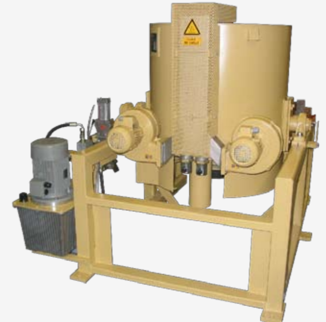
Special versions of baskets, sieves and adapter on request