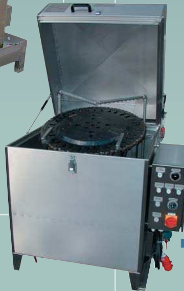
■ type W 80 with swivel device for milling disk up to \varnothing 800 mm

example for a device by plug-in for tools of processing centers for inner/outer cleaning