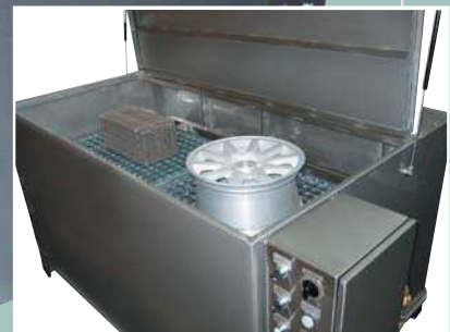
■ dipping basin with pneumatically oscillating grate, here for paint stripping of aluminium rim