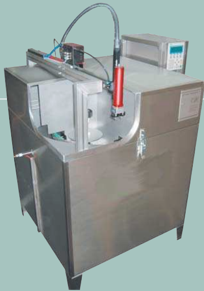
■ type RT continuous machine in round tact proceed with robot charging for single take-in of automat parts