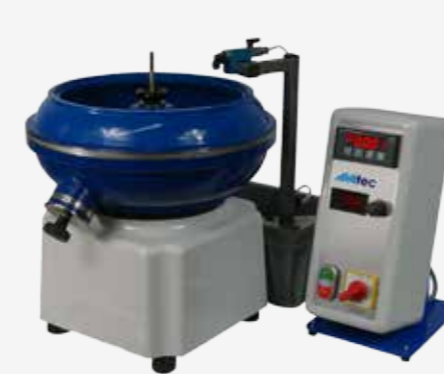
Trough Vibrators W

The working container can be divided up into 4 different chambers with optionally available partitions. Several workpieces can be finished separately without touching. Damage to sensitive workpieces is reliably avoided.