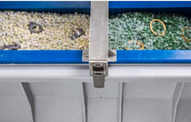
Trough Vibrators TV